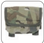
22-00302-56-000 3x grenade pouch -12.