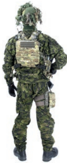
Plate carrier Strap-on DF -13 Shoulder pad set -12 Carrier pouch DF -12 40 mm Elastic T-bar set-12