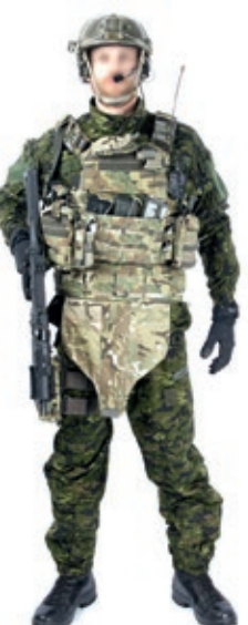
Plate carrier Strap-on DF -13 Carrier pouch DF -12 Combat belt -12 40 mm Elastic T-bar set -12 Ballistic groin protection set -12 (back only)