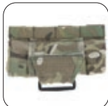
22-00301-56-000 Small dump pouch -12