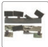
86-00038-56-000 Ballistic groin protection adapter set -11