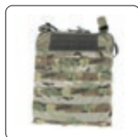
29-00293-56-000 Carrier pouch DF -12