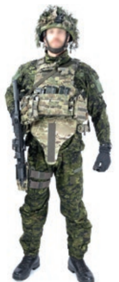
Plate carrier Strap-on DF -13 Carrier pouch DF -12 Shoulder pad set -12 40 mm Elastic T-bar set-12 Ballistic groin protection set -12 (front only)