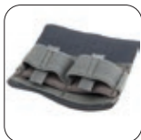
25-00307-09-000 Dual magazine insert -12