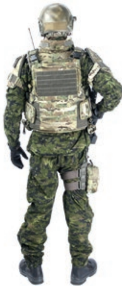
Plate carrier Strap-on DF -13 Velcro closure panel set -12 Ballistic yoke -12 Small ballistic sleeve -12