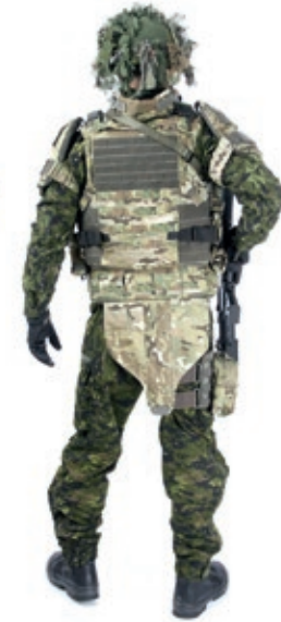
Plate carrier Strap-on DF -13 Velcro closure panel set -12 Ballistic yoke -12 Small ballistic sleeve -12 Ballistic belt -12 Ballistic groin protection -12