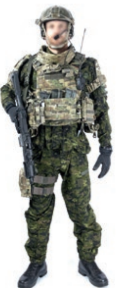
Plate carrier Strap-on DF -13 Carrier pouch DF -12 40 mm Elastic T-bar set-12 Ballistic yoke -12 Small ballistic sleeve -12