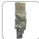
21-00298-56-000 GP pouch 3 -12