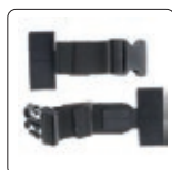
26-00280-01-000 Elastic T-bar set -12