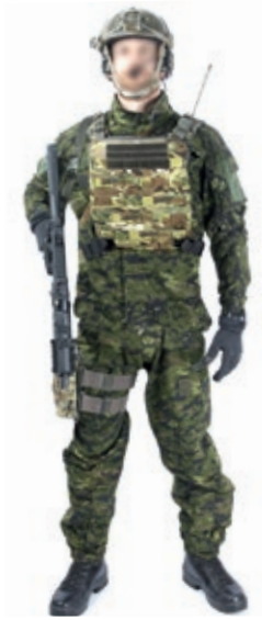
2 x Carrier pouch DF-12 Padded shoulder straps Elastic T-Bar set -12 Long T-Bar set -12