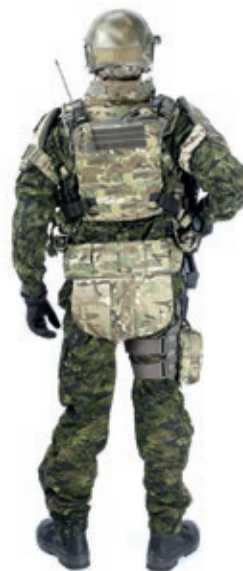
Plate carrier Strap-on DF -13 Carrier pouch DF -12 Ballistic yoke -12 Small ballistic sleeve -12 Ballistic belt -12 Ballistic groin protection -12