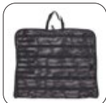
28-00431-01-000 Medium mesh bag -12