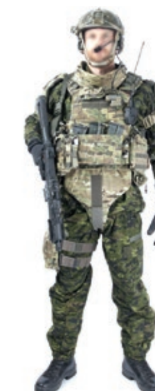
Plate carrier Strap-on DF -13 Ballistic yoke -12 Carrier pouch DF -12 40 mm Elastic T-bar set -12 Small ballistic sleeve -12 Ballistic groin protection -12 (front only)