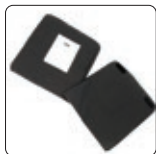
81-00119-01-000 Ballistic front/back panel set -11