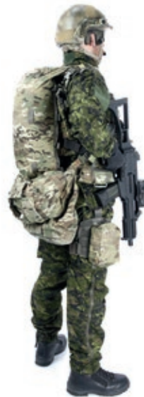
Flap and one side pocket of the 120L Backpack system -12 attached to the back.