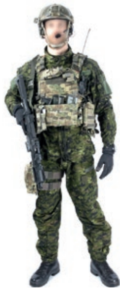
Plate carrier Strap-on DF -13