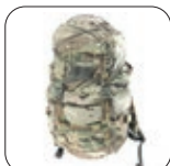
29-00394-56-000 30L mission backpack -12