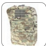
29-00363-56-000 All pack -12.