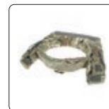
85-00337-56-000 Ballistic yoke-12