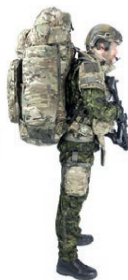
120L Backpack system -12 carry outside a complete Strap-on DF -13 system