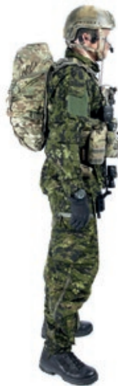
30L mission backpack -12 attached to the yoke.