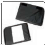
81-00118-01-000 Ballistic side panel set -11