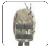
21-00349-56-000 XXS pouch -12.