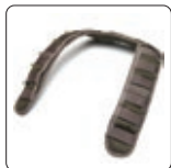
26-00157-09-000 Padded yoke -12