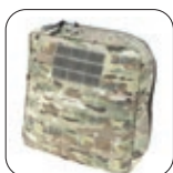
28-00427-56-000 All bag -12