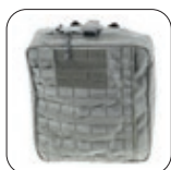
28-00271-09-000 Multi-purpose bag -12