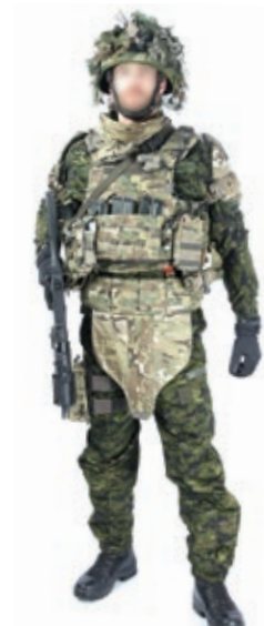
Plate carrier Strap-on DF -13 Ballistic yoke -12 Carrier pouch DF -12 40 mm Elastic T-bar set -12 Small ballistic sleeve -12 Ballistic belt -12 Ballistic groin protection -12