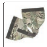
85-00009-56-000 Ballistic groin protection set -12