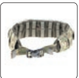
13-00116-56-000 Modular combat belt -12

13-00116-XX-012 Small 13-00116-XX-013 Medium 13-00116-XX-014 Large 13-00116-XX-015 XLarge