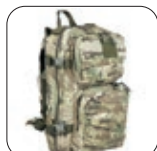
29-00027-56-000 25L Specialist backpack -11