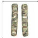
26-00156-56-000, Shoulder pad set -12