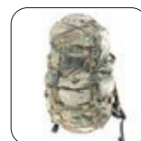
29-00394-56-000 30L mission backpack -12