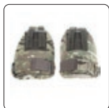
85-00338-56-000 Small ballistic sleeve set -12