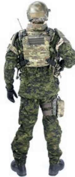
Plate carrier Strap-on DF -13 Carrier pouch DF -12 40 mm Elastic T-bar set -12 Ballistic yoke -12 Small ballistic sleeve -12