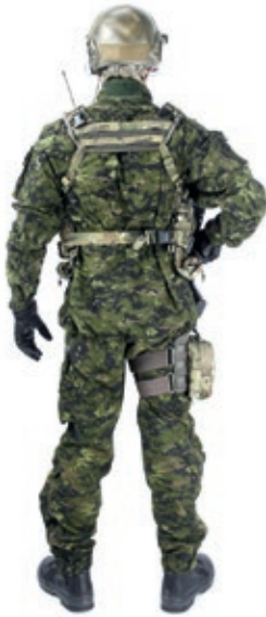
Plate carrier Strap-on DF -13