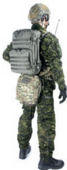
25L Specialist backpack -11 and the All bag -12 attached to the yoke and back.