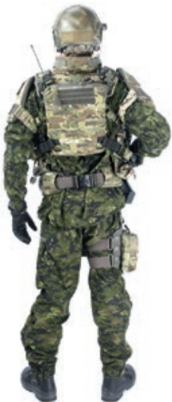
Plate carrier Strap-on DF -13 Carrier pouch DF -12 40 mm Elastic T-bar set -12 Ballistic yoke -12 Small ballistic sleeve -12 Ballistic belt -12 Ballistic groin protection -12 (back only) turned to the front