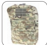
29-00363-56-000 All pack -12.