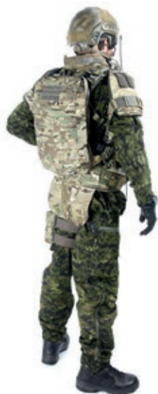
All pack -12 attached to the back.