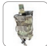
22-00094-56-000 Speed magazine pouch -12.