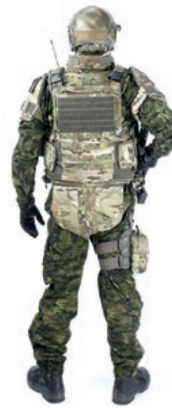
Plate carrier Strap-on DF -13 Velcro closure panel set -12 Ballistic groin protection -12 Ballistic yoke -12 Small ballistic sleeve -12