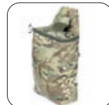
22-00519-56-000 Dump bag -10