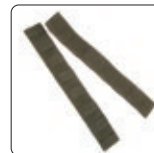
SSS-11 Shoulder strap set -11