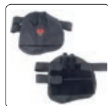
85-00418-01-00 Large ballistic sleeve set -12