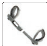
26-00487-09-000 I-Bar -10