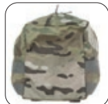
21-00279-56-000 Small pouch -12.