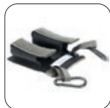
25-00308-01-000 Grenade insert -12