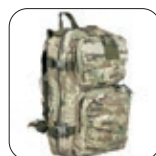
29-00027-56-000 25L Specialist backpack -11