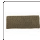
26-00031-09-000 Back support pillow -11