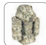
29-00430-56-000 120L Backpack system -12