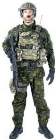
Plate carrier Strap-on DF -13 Carrier pouch DF -12 Ballistic belt -12