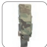
21-00167-56-000 GP pouch 2 -12.