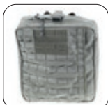
28-00271-09-000 Multi- purpose bag -12