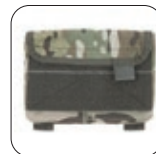
21-00309-56-000 Admin pouch-12.