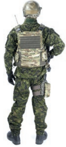
Plate carrier Strap-on DF -13 Velcro closure panel set -12