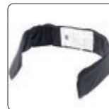
81-00594-01-000 Ball. ins. Combat belt -12 Small-XLarge