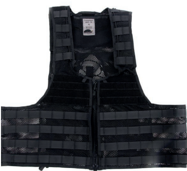
The front, sides and shoulders are covered with MOLLE webbing.