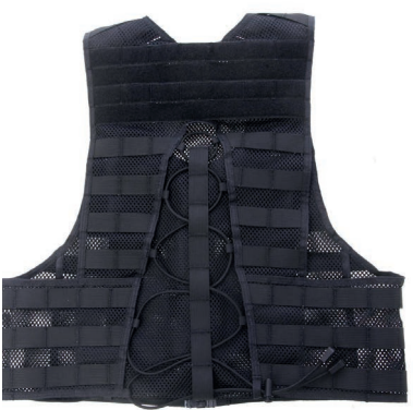
The size is adjustable 15-20 cm with an elastic cord in the back.