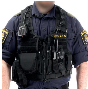
The vest is compatible with the MOLLE/PALS system and all pouches can be attached securely to it.