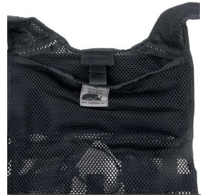
In the back a compartment for a hydration system is placed. Closes in the top with Velcro.