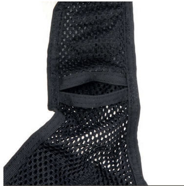
Channels in the shoulders for cables to the radio. Keeps them safe.