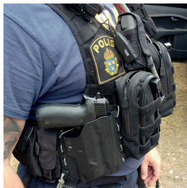
Pistol holster in hard plastic can also be attached to the vest.