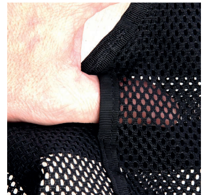
There are openings in the side from the zipped front pockets so cables can be pulled out.