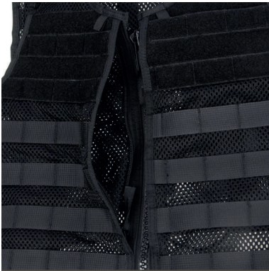
Two zipped front pockets. Zipped front closure.