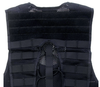
On the back a large area is covered with loop Velcro. Here a 10x25 cm patch can be attached.